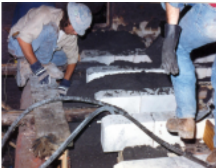
Hearth installation with skid block and castable