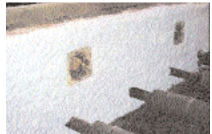
The applied surface can be used immediately after installation.