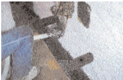
Foamfrax insulation installs easily around apertures in the lining.