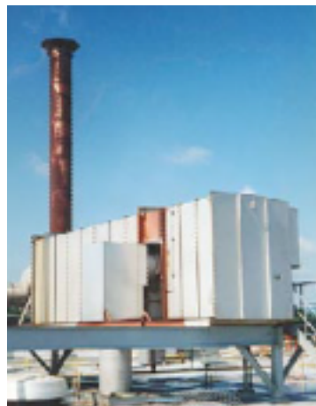
Recuperative Thermal Oxidizer

F.S. Sperry Co., Inc. 1907 Vanderhorn Drive Memphis, TN. 38134